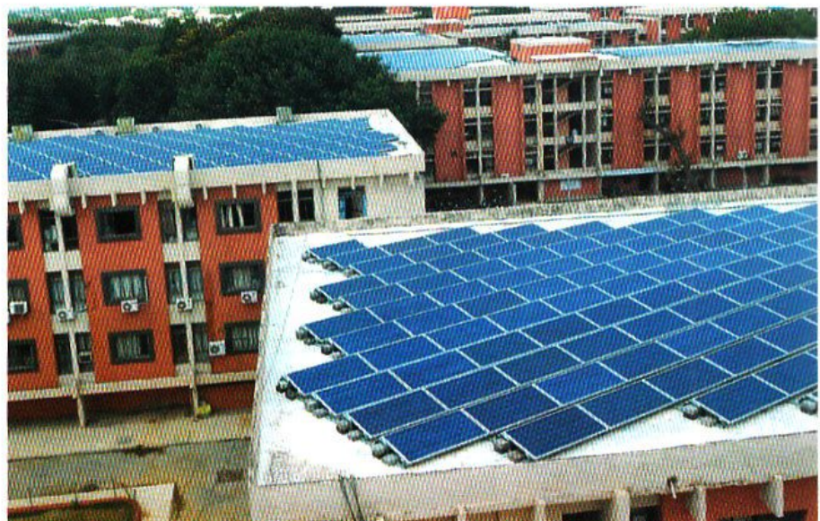
Hartek Solar's rooftop solar installations in Chandigarh locality