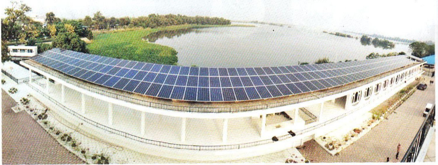
80-kWp rooftop solar plant at Gurdwara Ishardham Nanaksar in Harike Pattan, Punjab

Solar Park, Rajasthan, another 100-MW project in Pavagada Solar Park, Karnataka, five projects ranging from 30-50 MW in Gujarat and a 40-MW project in Uttar Pradesh. Optimistic about bagging sizeable orders after the next rounds of auctions in coming months with projects to the tune of 500 MW already in its kitty, Hartek Power is expected to further improve upon its performance by the end of the current financial year.